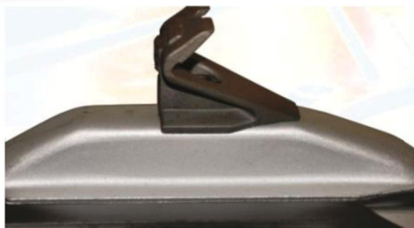
Strong and durable made of special steel