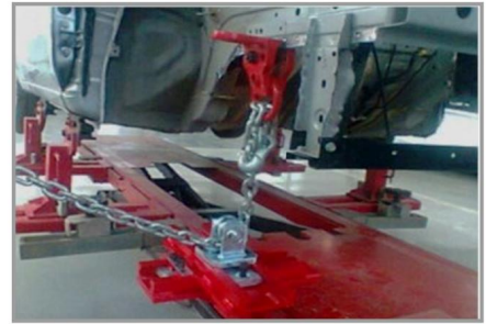
HOLDING AND ANCHORING SYSTEM

* Specifications subject to change without notice