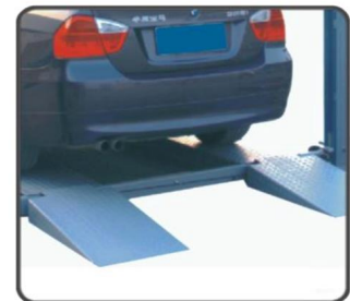
Low Profile Drive-on Ramp